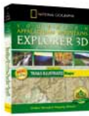
Southern Appalachian Mountains Explorer 3D