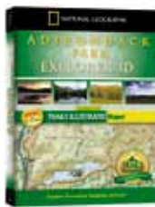
Adirondack Park Explorer 3D