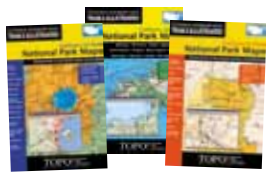
TrailSmart Regional Titles