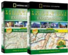
National Park Explorer All Individual Park Titles (e.g. Big Bend, Yellowstone, Yosemite, etc.)