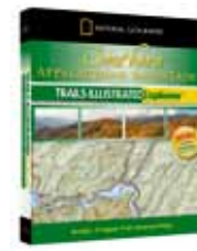
Southern Appalachian Mountains Explorer