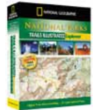
National Parks Explorer 3D