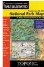
15 National Parks