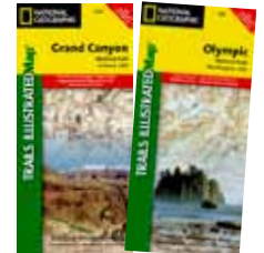
All Future Titles or Downloads in which the base maps are proprietary Trails Illustrated Maps